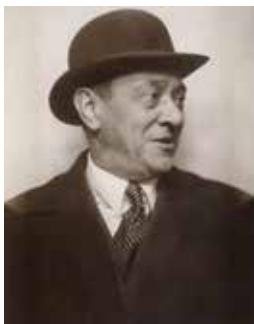
Arnold Schönberg, Berlin, 1930

Arnold Schönberg (1874 – 1951) as composer, teacher and theoretician he was one of the defining figures of the 20 th century. Advocating progress in music, Schönberg embodied the courage to break with conventions.