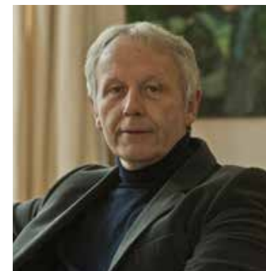
Charles Spencer